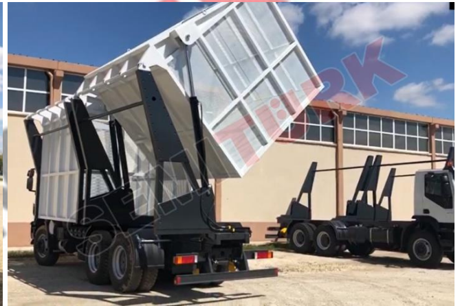
Application on truck chassis - "High Dump Forage Wagons | Sugar-cane Transport Equipment"