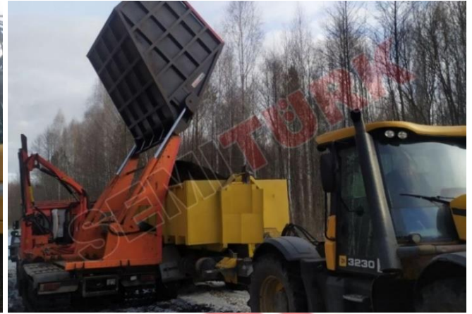
Application on tracked vehicle chassis - "High Lift Side Dump Box for Silage Harvesting"