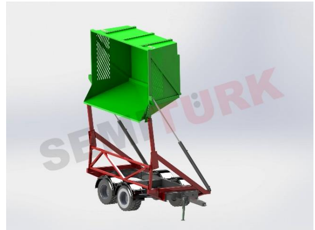
Application on trailer chassis - "Sugarcane Self Tipper / Tipping Trailer"