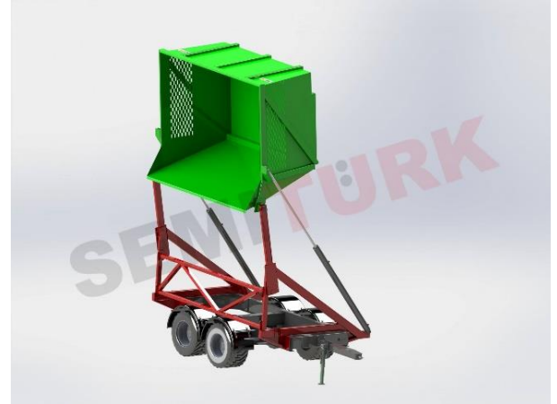
Application on trailer chassis - "Sugarcane Self Tipper / Tipping Trailer"