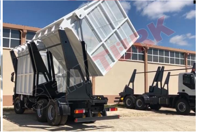
Application on truck chassis - "High Dump Forage Wagons | Sugar-cane Transport Equipment"